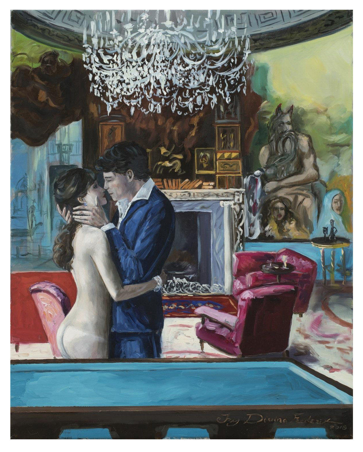
Show me what you are made of 40×50 cm Oil on canvas EUR 3500