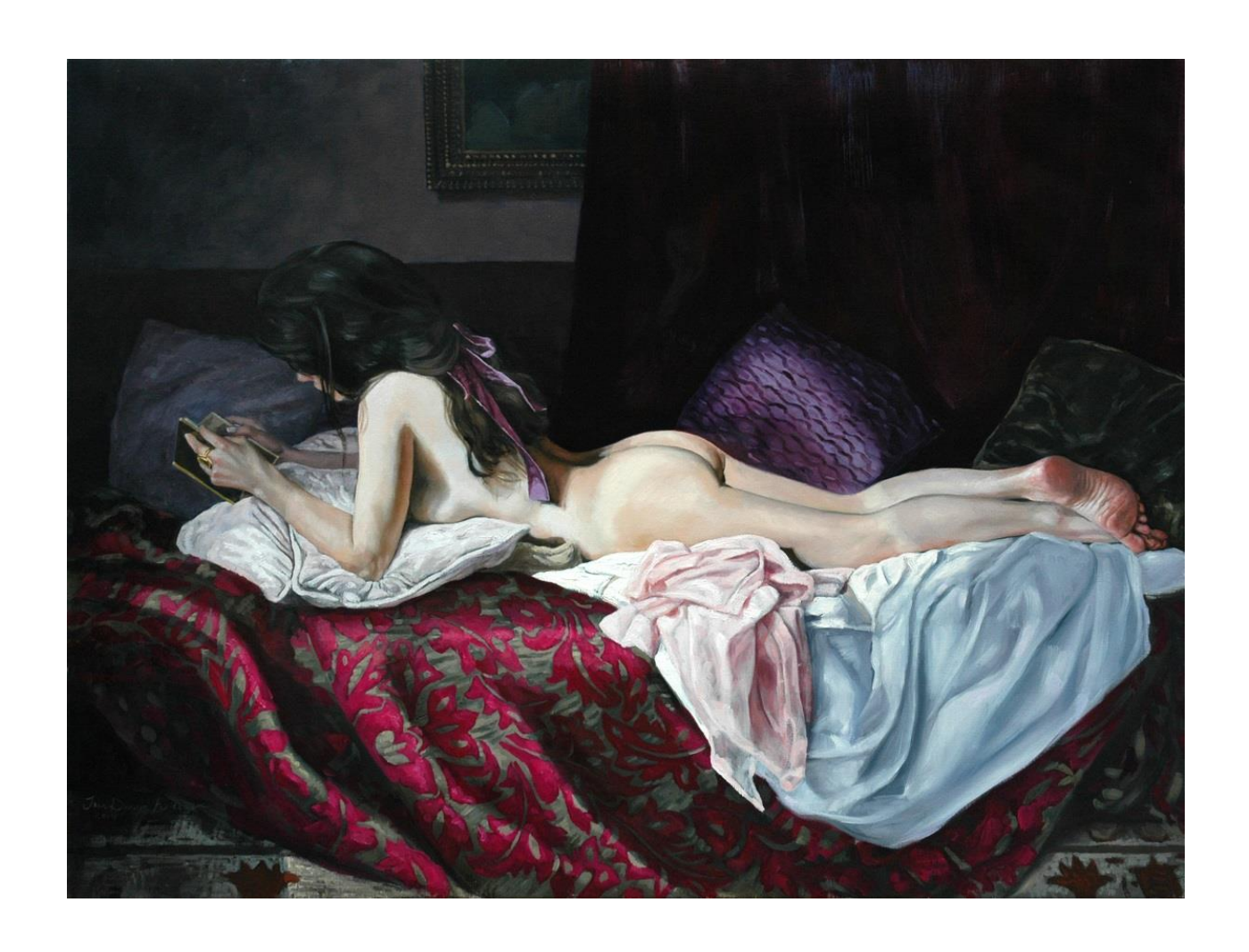
Iris Frederix | Amant Oil on canvas 120 x 90 cm SOLD